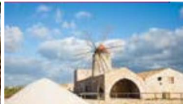
VIA DEL SALE

The amazing salt marshes of the Marsala Stagnone Lagoon